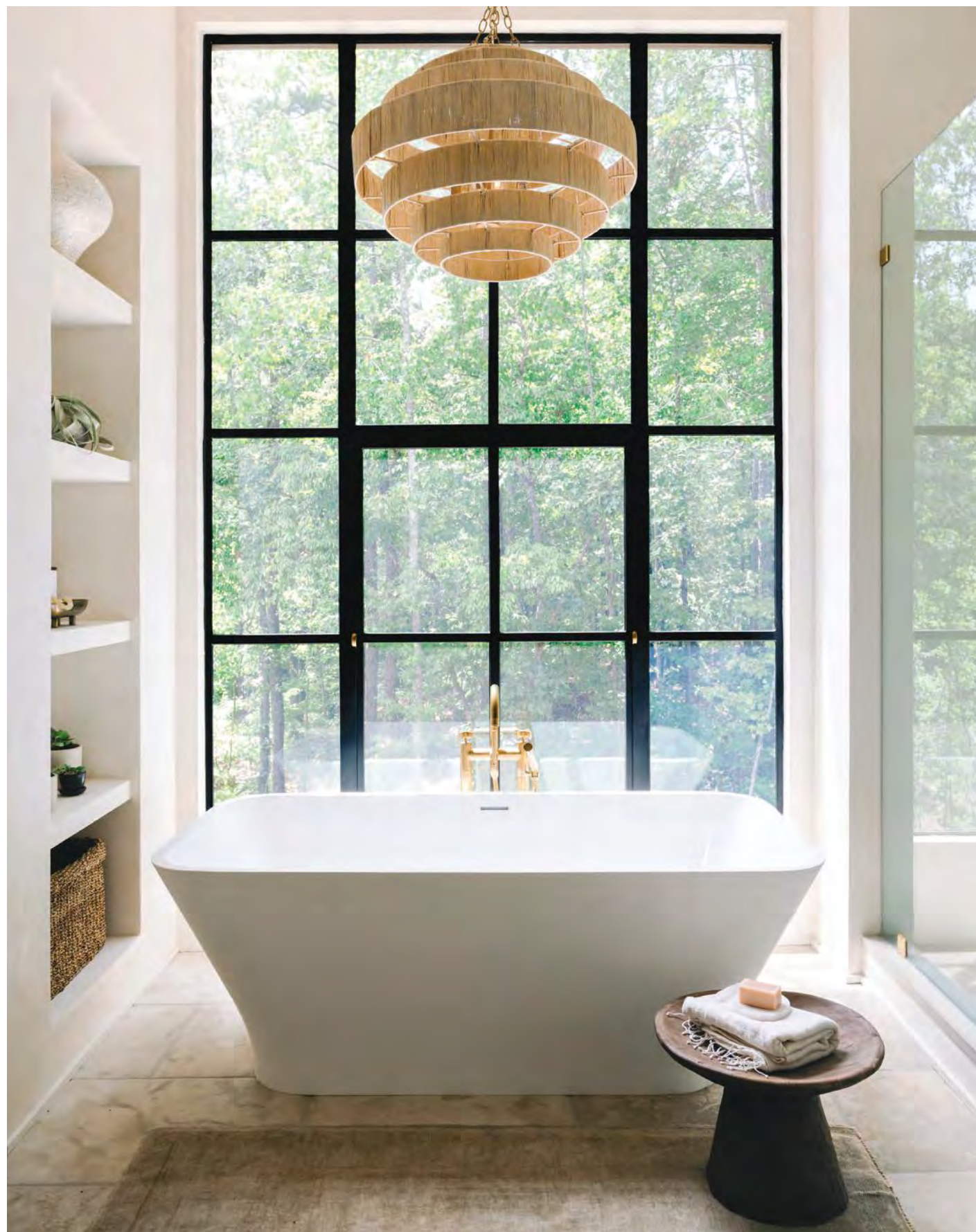
ADDISON ♦ 3 models available from 58" to 66" in length ♦ also shown at top right