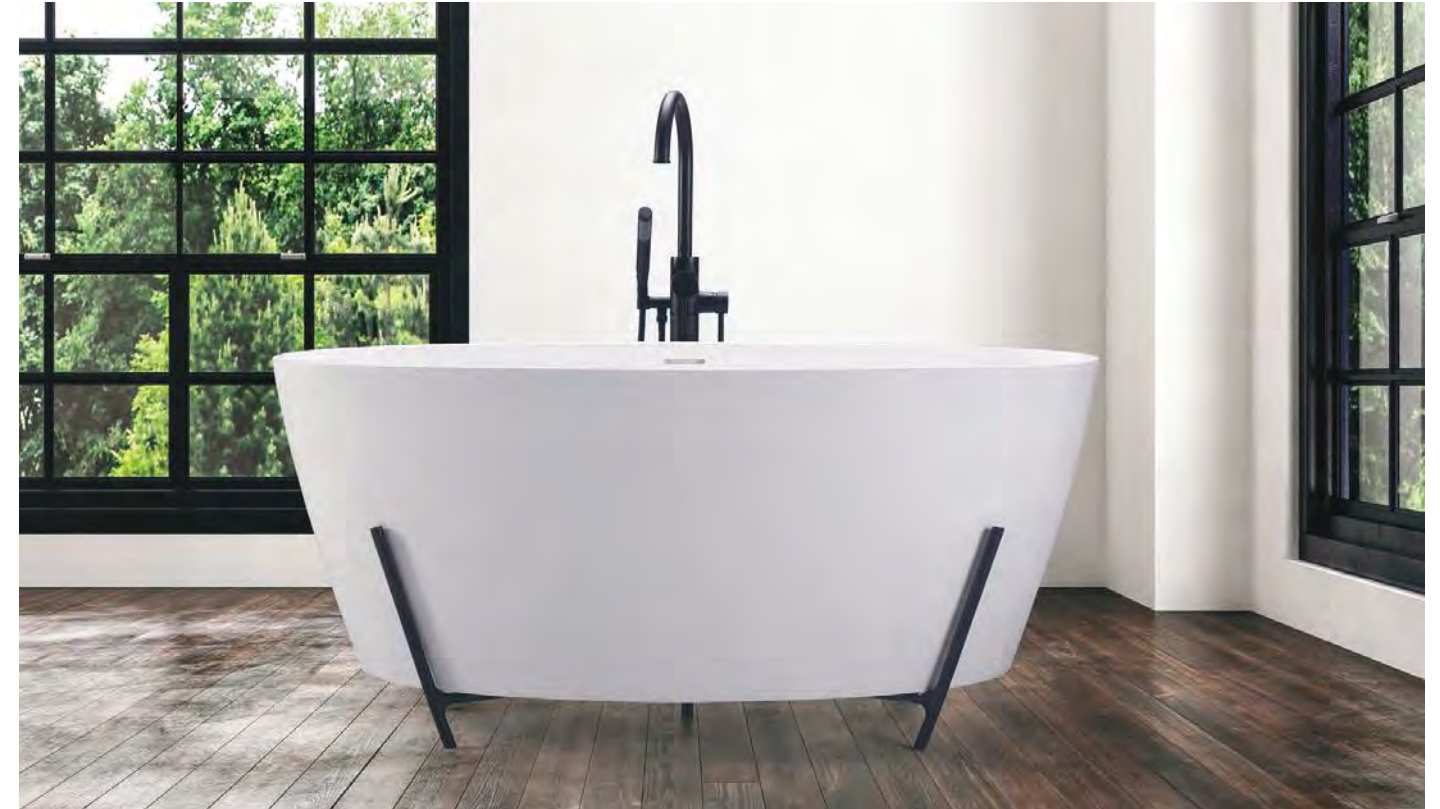
ELENA WITH CRADLE ♦ 2 models available from 58" to 65" in length with flat or semi-rolled lip ♦ cradle available in many colors