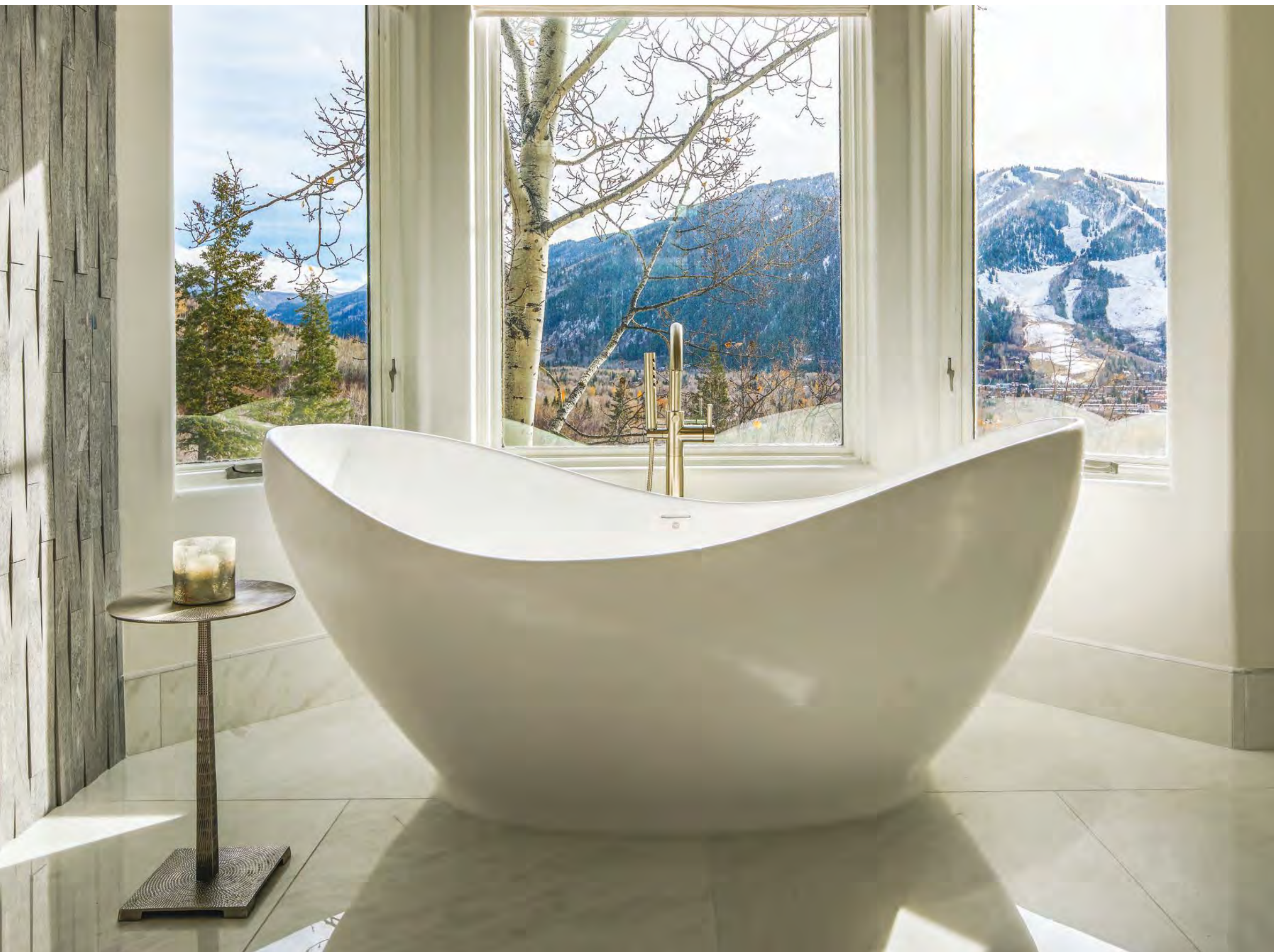
JULIET ♦ 2 models available 67" and 72" in length