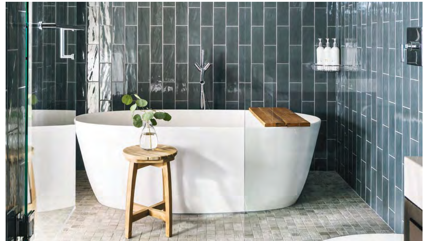
ELENA WITH AVAILABLE PEDESTAL OPTION ♦ 66" in length with flat or rolled lip ♦ pedestal not shown