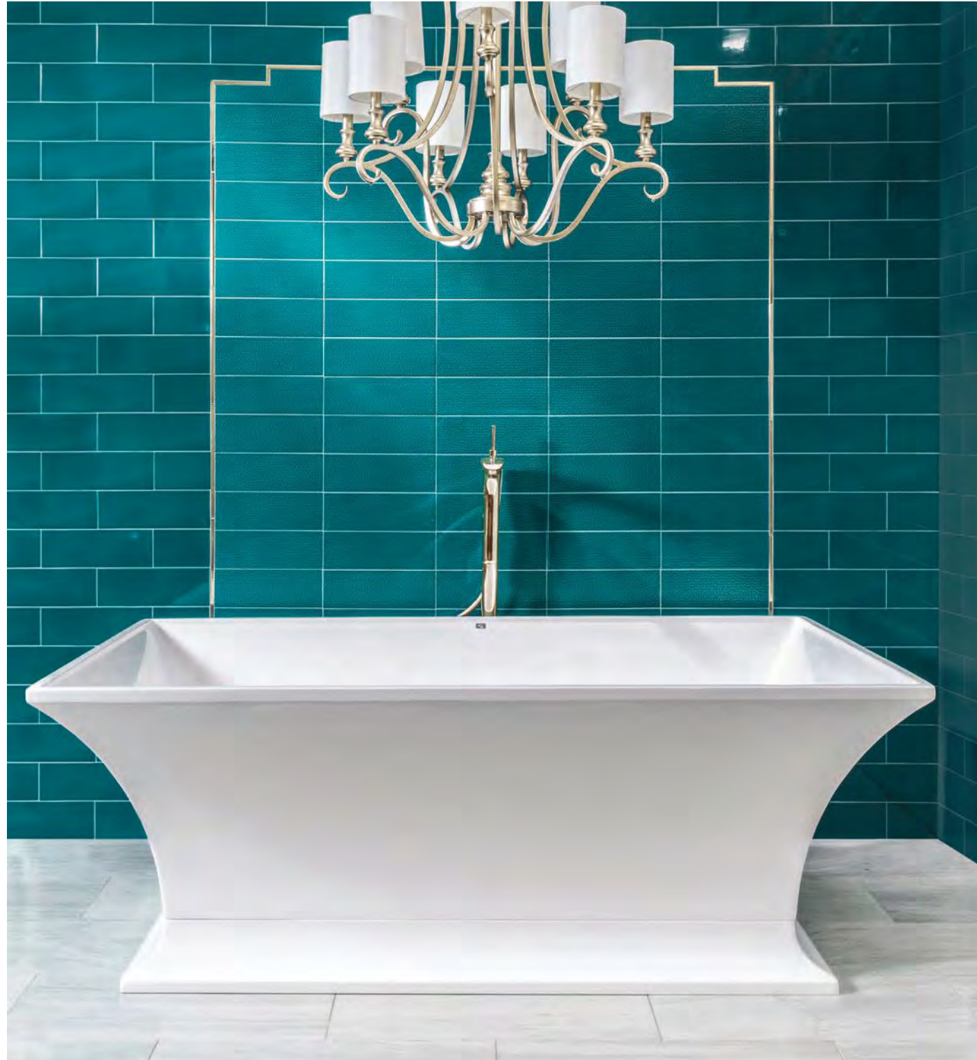
INTARCIA ♦ 67" in length shown with pedestal ♦ shown to the right without pedestal

The Intarcia tub, as well as the Continuum and Intarcia sinks, were designed by internationally renowned kitchen and bath designer Matthew Quinn. The Intarcia tub is available with the pedestal base shown above.