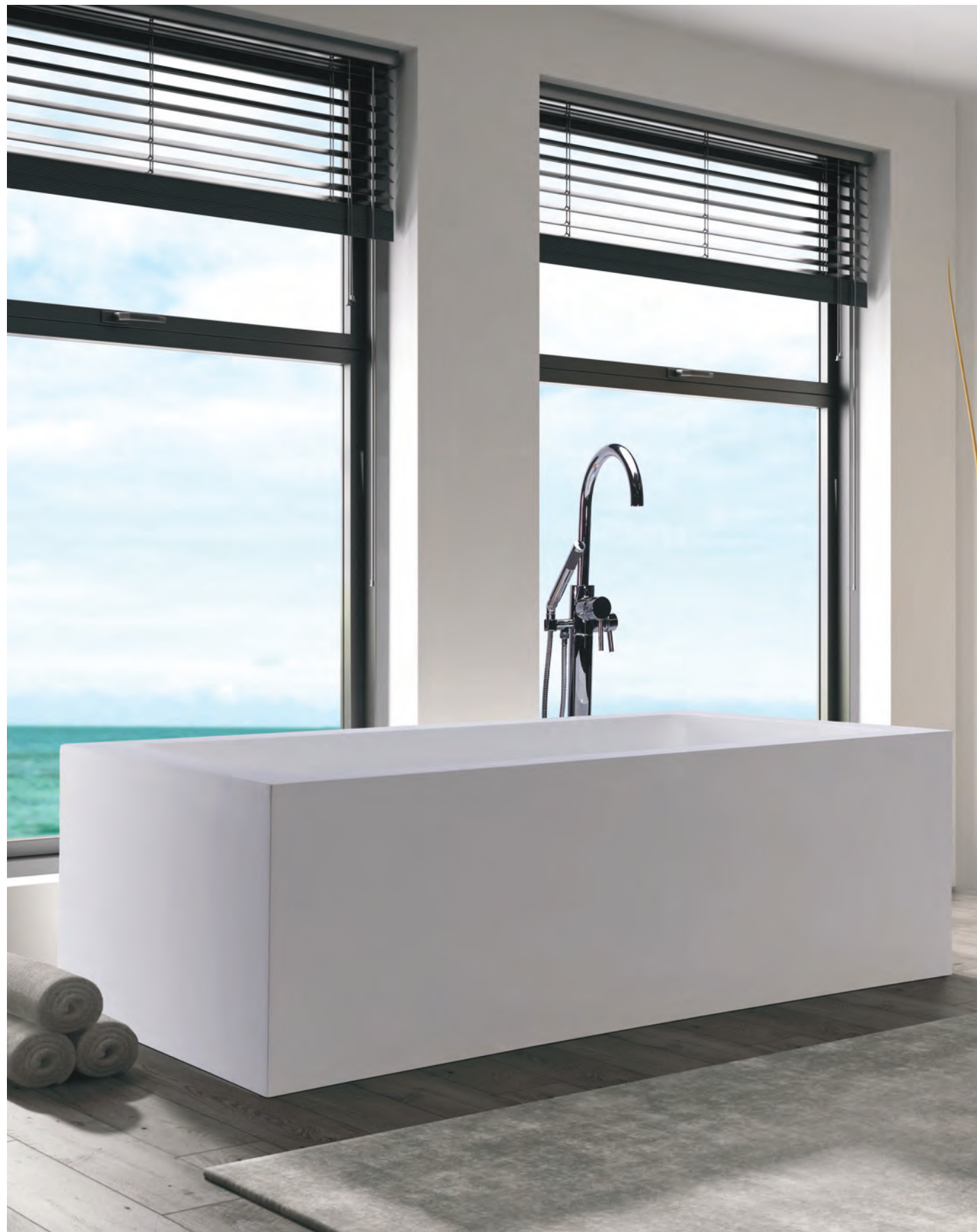
MADDUX ♦ 2 models available from 59" to 65" in length