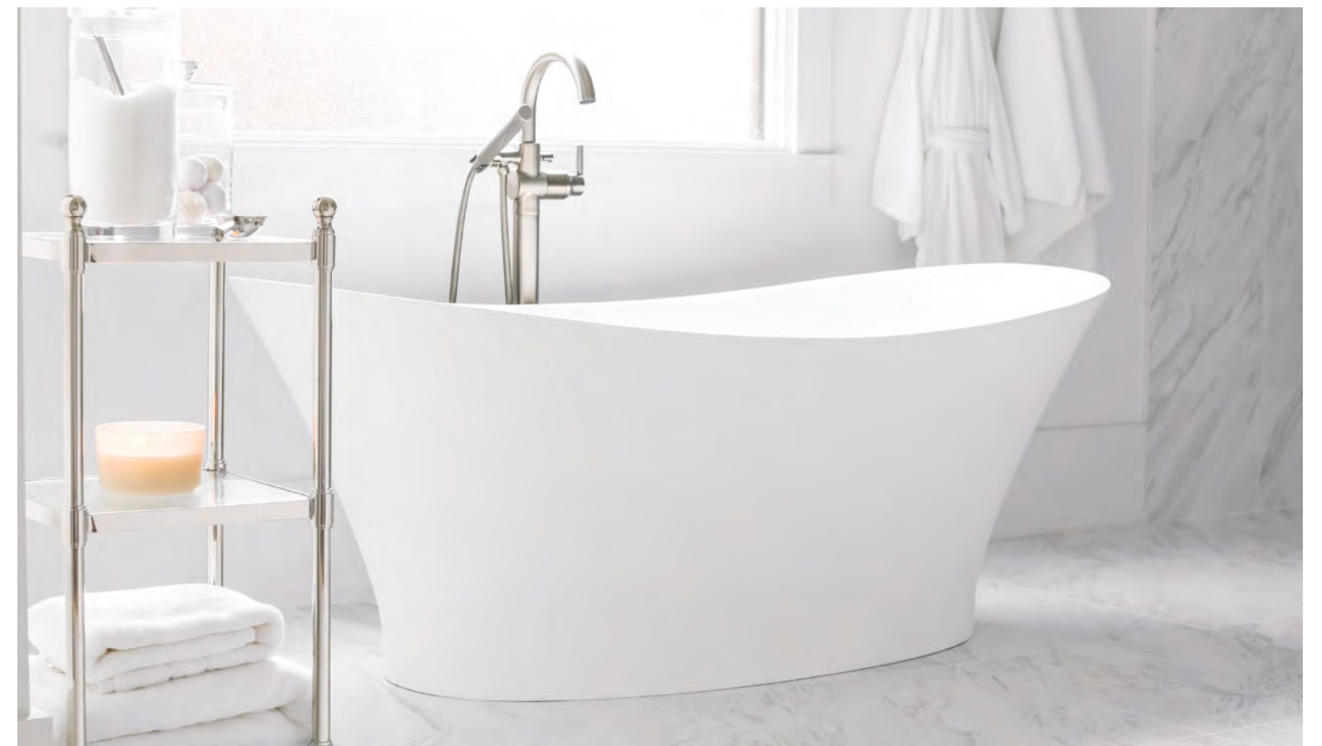
MALLORY ♦ 60" in length