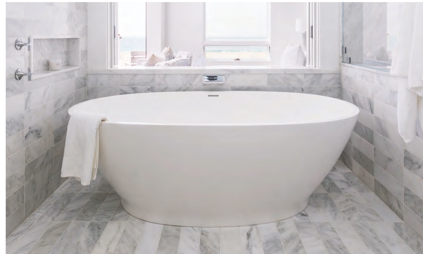
ALISSA ♦ with integrated pedestal ♦ 6 models available from 62" to 73" in length