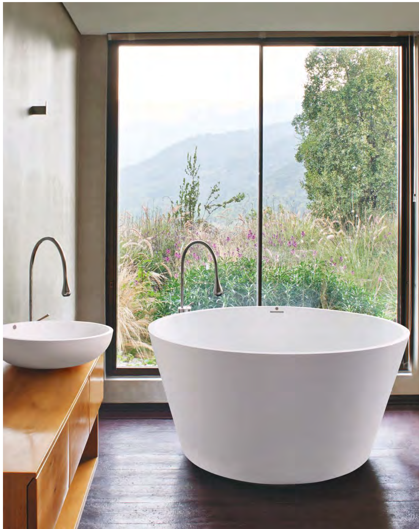
HALO ♦ 52" round with flat or rolled lip