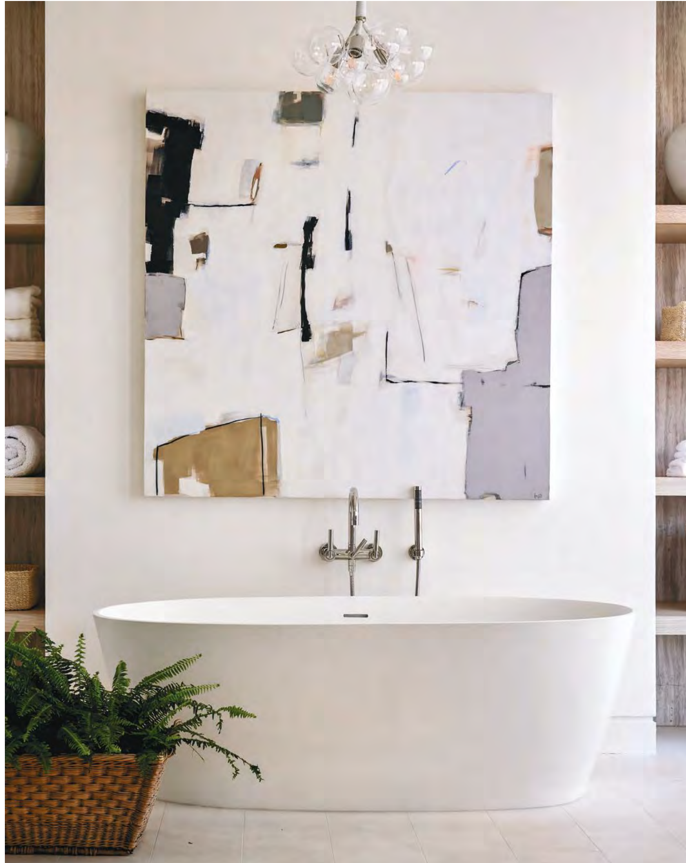
ELENA ♦ 2 models available from 58" to 65" in length with flat or semi-rolled lip