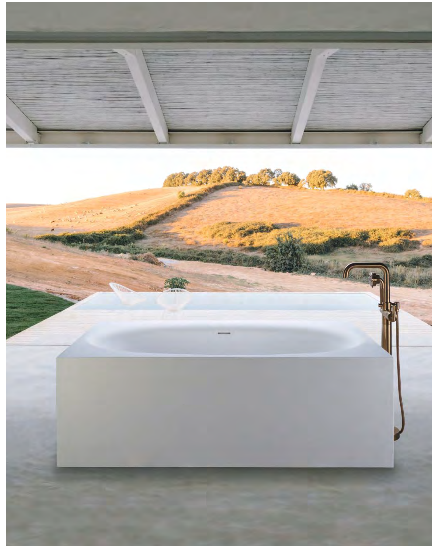
AKANA ♦ 66" in length