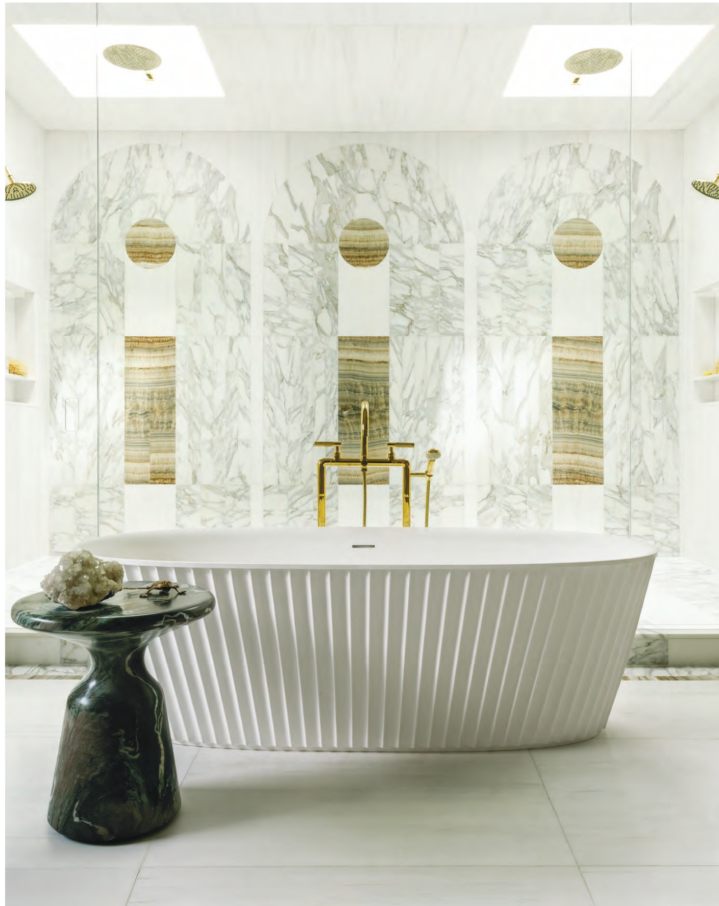
BOWIE ♦ 70" in length