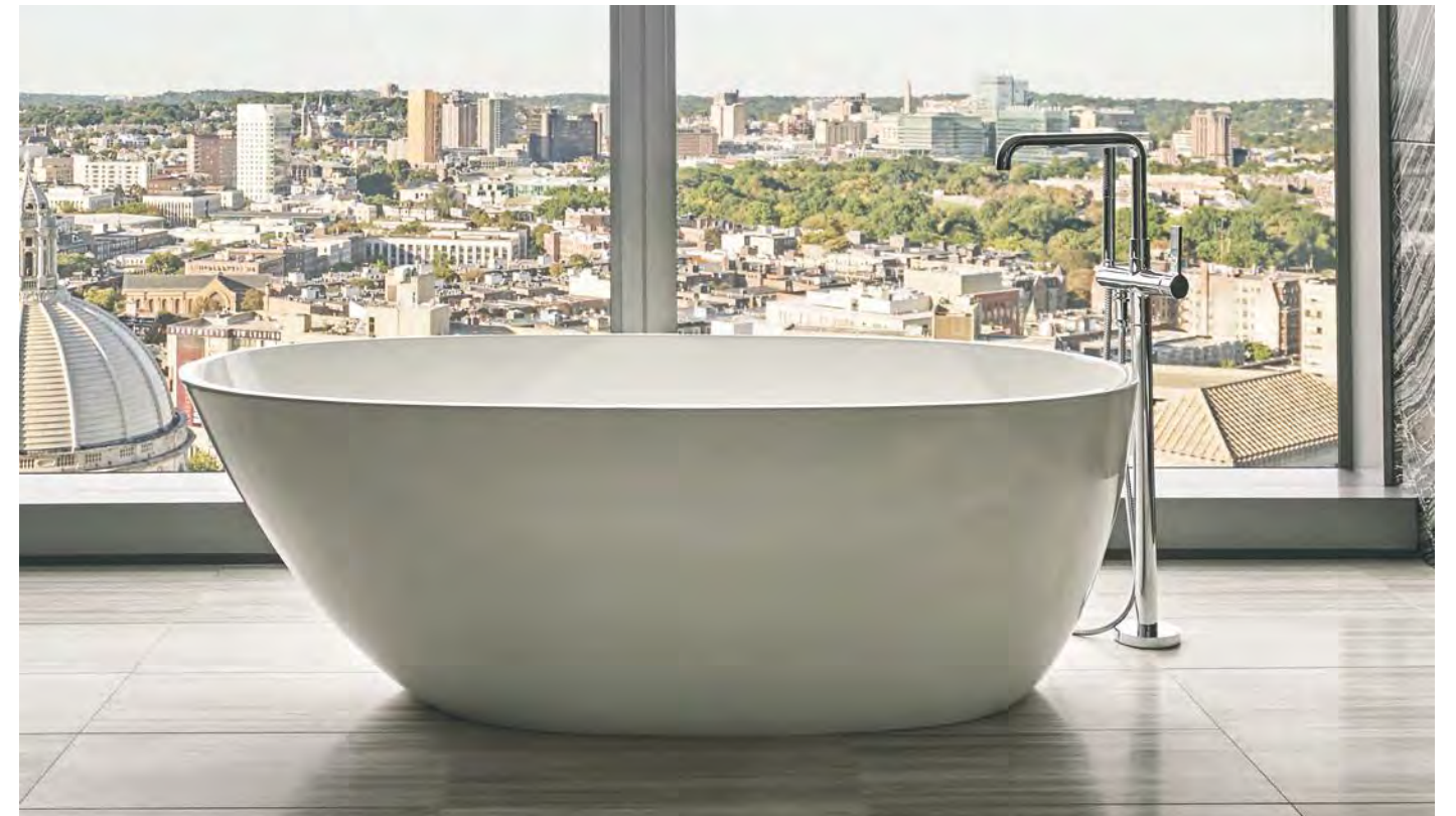
LYDIA ♦ 66" in length