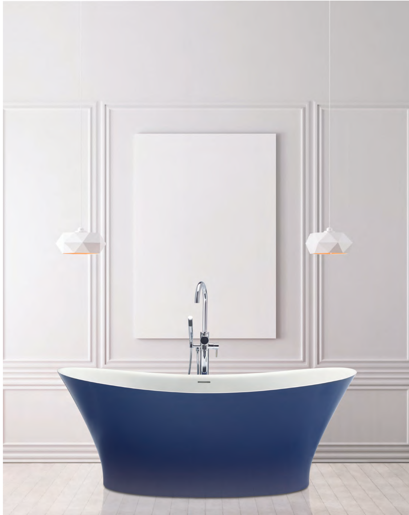
MALLORY ♦ 66" in length shown in Sapphire Blue exterior