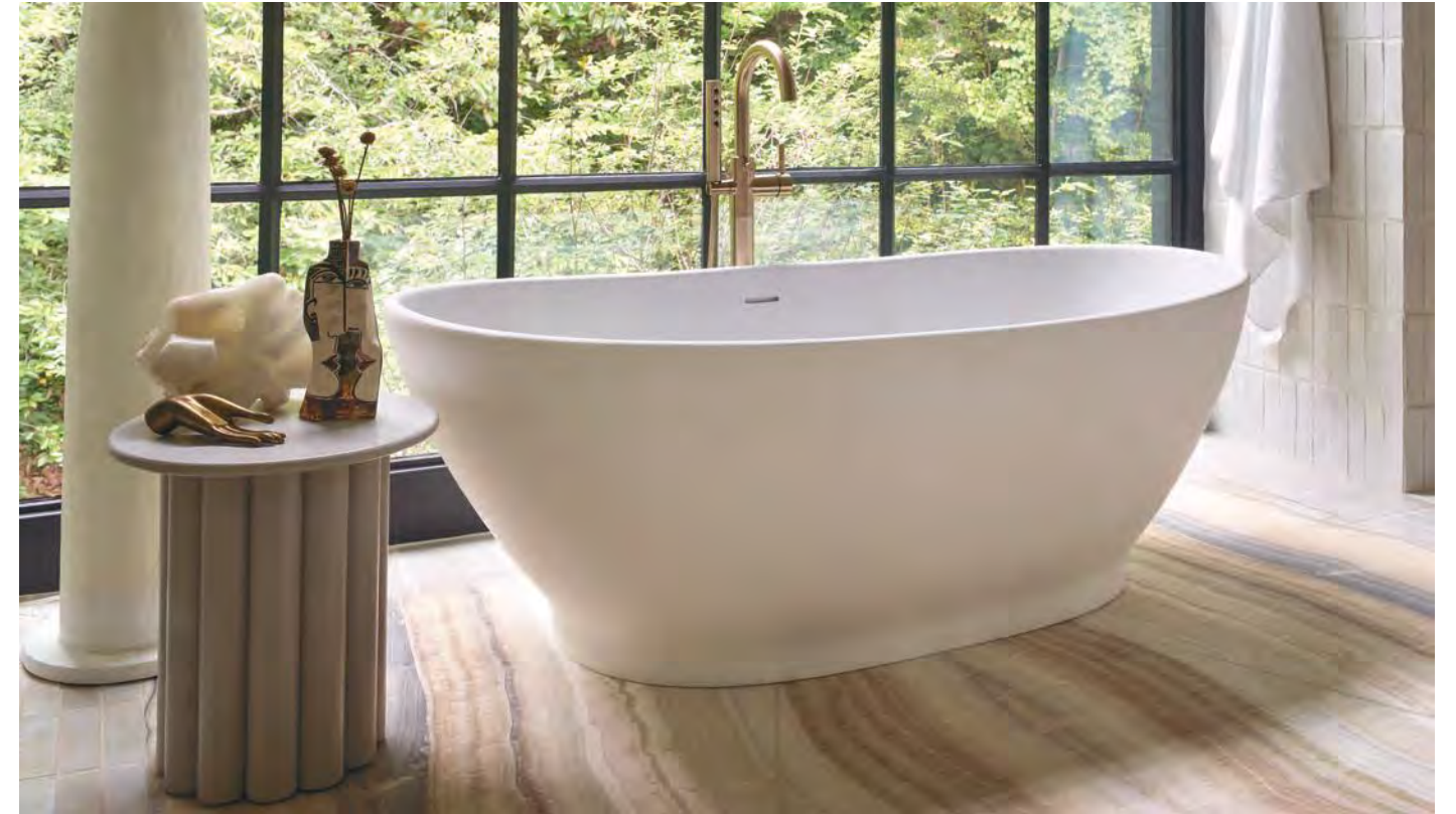
ELISE ♦ with integrated pedestal ♦ 6 models available from 62" to 73" in length