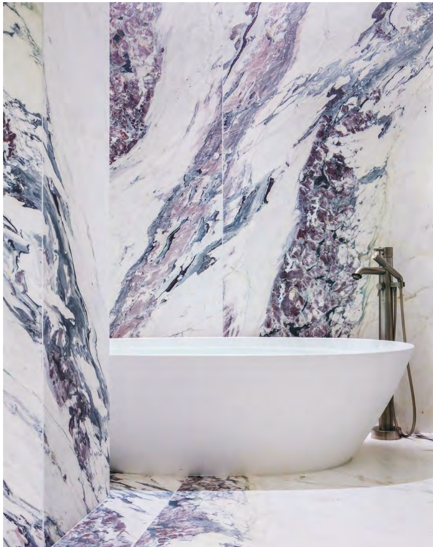
ALISSA ♦ 2 models available from 62" to 73" in length ♦ optional low-profile recessed pedestal shown at the bottom right