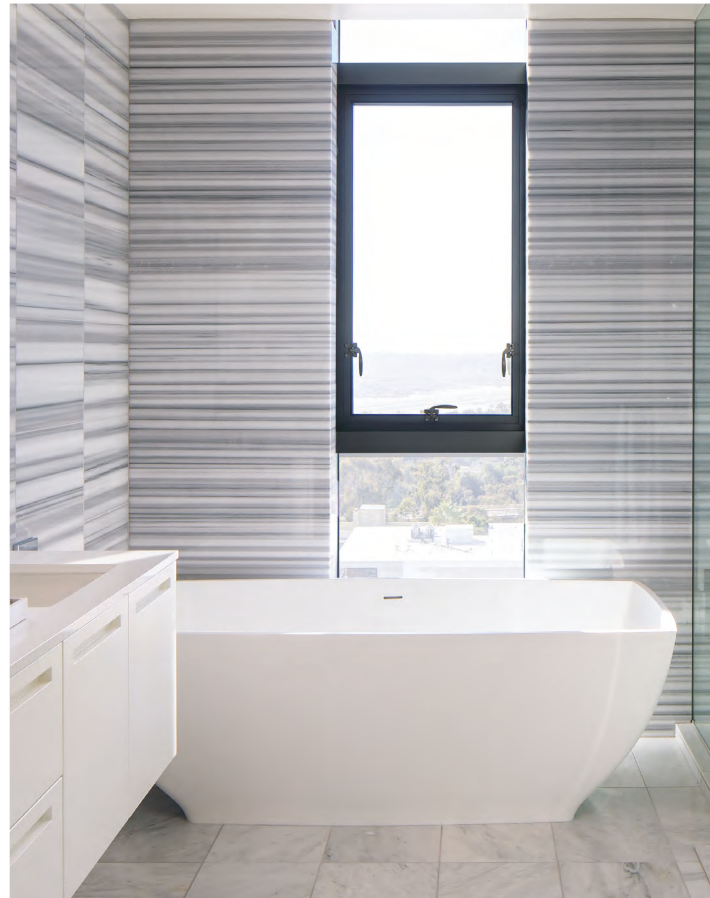
ADRIAN ♦ 68" in length