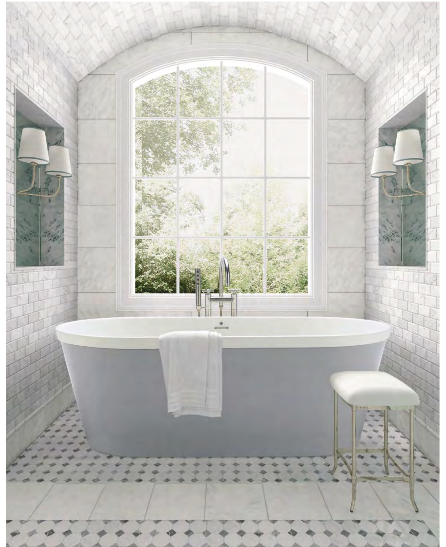
THE BLAKE ♦ 66" in length shown in Stratus Gray exterior