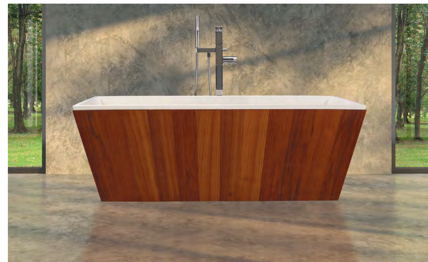
PETRA WITH TEAK WRAP ♦ 60" in length ♦ also available without teak