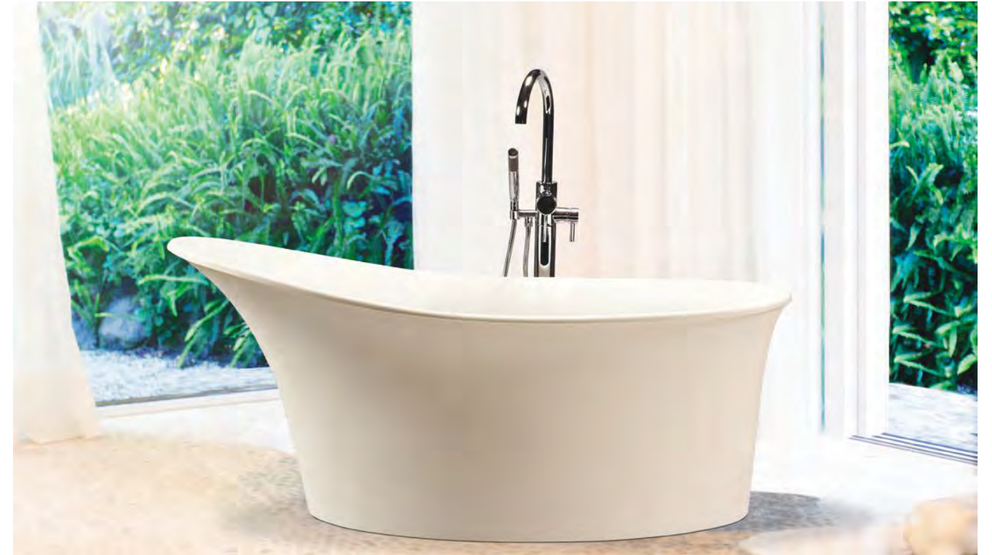
LILY ♦ 60" in length