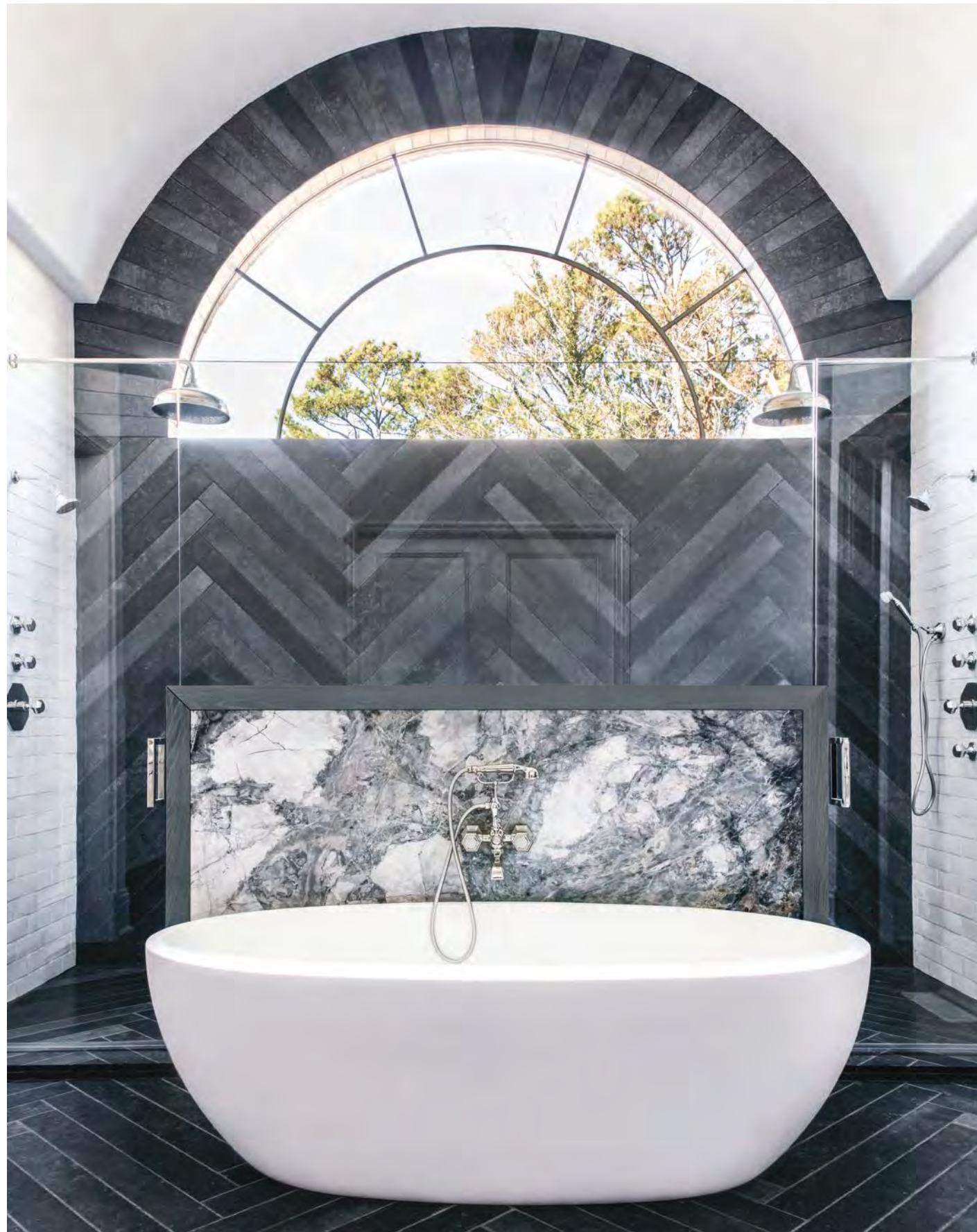
CÁSSANDRA ♦ 72" in length