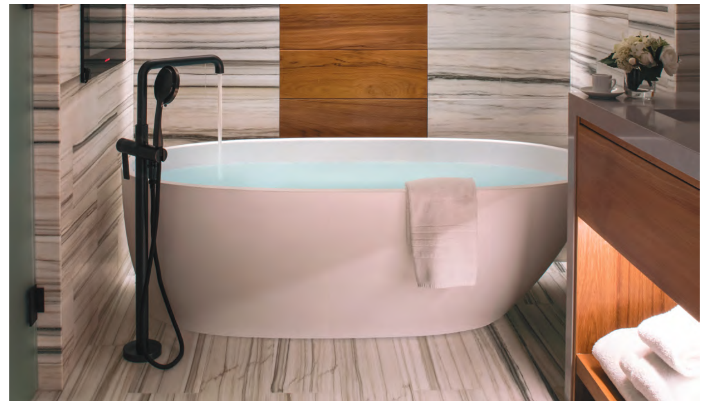
LYDIA ♦ 56" in length