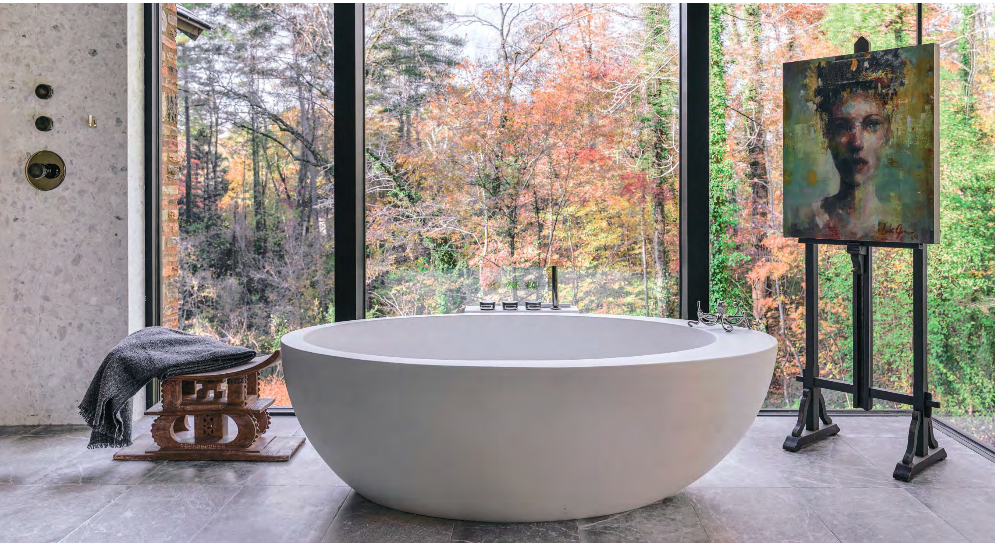
CÁSCARA ♦ 71" in length