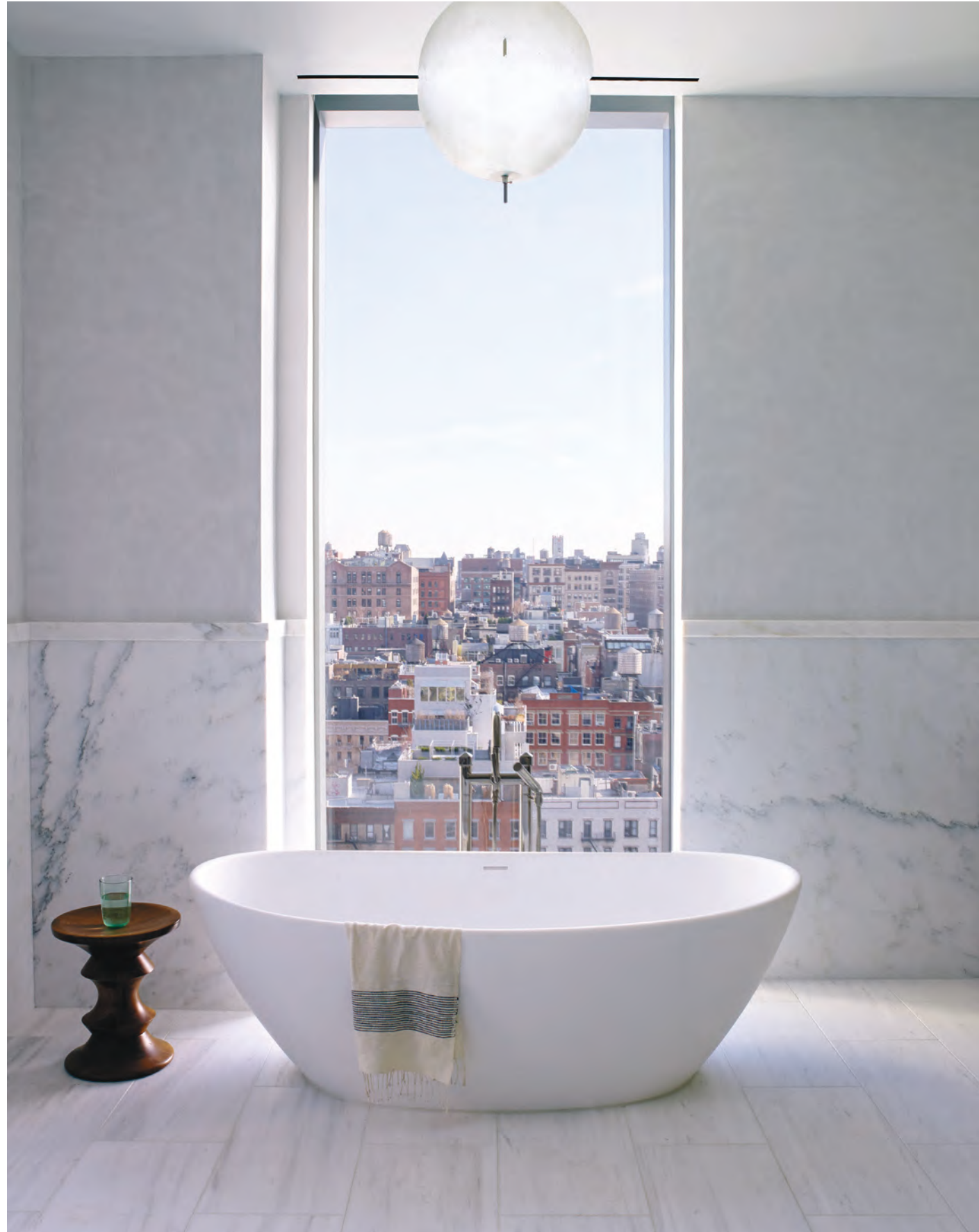
ELISE ♦ 3 models available from 62" to 73" in length ♦ optional low-profile recessed pedestal shown at the bottom right